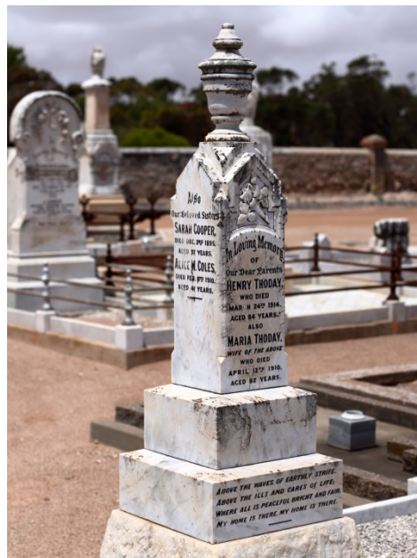
Sarah Cooper (nee Thoday)

West Terrace Cemetery Section: Road 5 Path Number: 31 A/E/W: Site Number: 22 Service Type: Burial